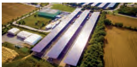
CAR PARK SHELTERS IN DEUX-SÈVRES (79)