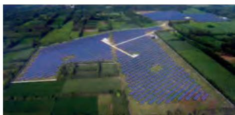
GROUND-MOUNTED POWER PLANT IN UTTARAKHAND, INDIA