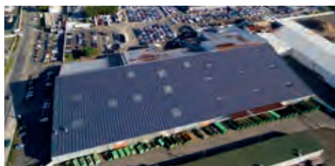
SUPPORT FOR RENOVATION OF LARGE ROOFS IN DEUX-SÈVRES (79)